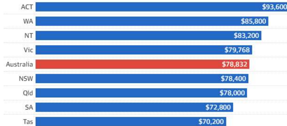
• Source: ABS • Get the data

Median annual employee earnings by state, August 2022